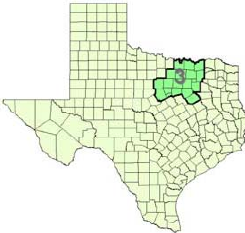
Public Health Region 3

Located in north central Texas, these counties are mostly urban with 96 percent of the population clustering around the larger cities such as Dallas, Fort Worth, Arlington, Plano, and Garland. These cities are 5 of the 10 largest cities in Texas.